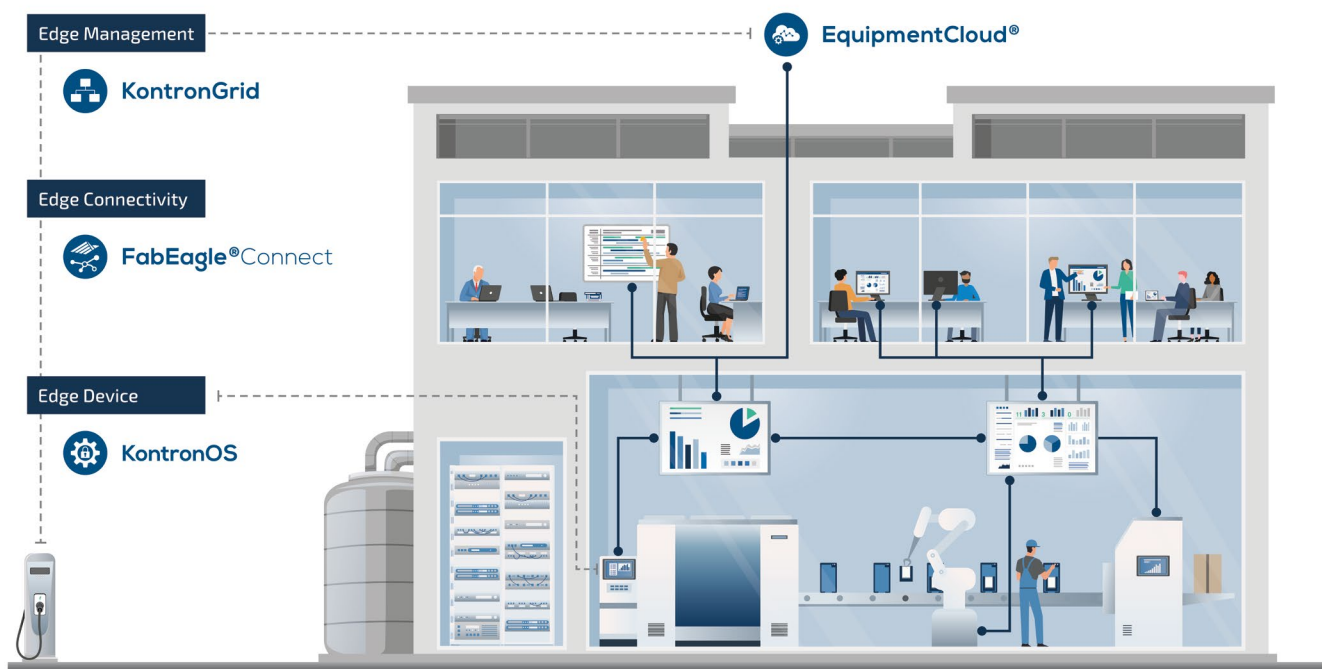
Example of a practical edge stack for manufacturers.